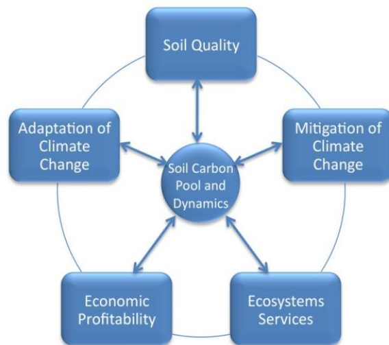
Figure 3. Data analysis and synthesis in relation to evaluating the carbon footprint, conducting life cycle analyses and assessing the use efficiency of input for a suite of agronomic practices.

Soil Organic Carbon. The dynamics of the SOC pool is the key determinant of soil quality because of its strong impact on soil properties and fluxes of GHGs, both factoring into mitigation and adaptation to climate change, ecosystem services, and economic profitability (Figure 3). The soil quality impacts of SOC are attributed to its effects on the chemical, physical, and biological properties of soil. Therefore it is important to characterize these properties at the outset of our project and to evaluate the subsequent changes in SOC over time caused by the range of corn-based cropping systems envisaged in the program.