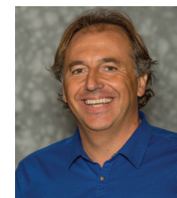
Michigan State University