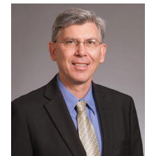
Iowa Soybean Association Former President