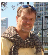
University of Wisconsin-Madison (Emeritus)