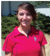
University of Wisconsin Madison