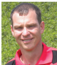
University of Wisconsin-Madison