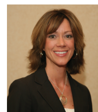
Illinois Fertilizer & Chemical Association