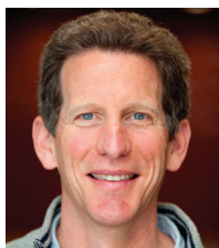
University of Wisconsin Madison