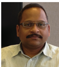
The Climate Corporation