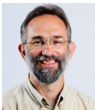
University of Missouri