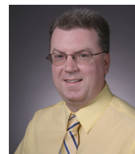
Iowa State University