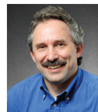
South Dakota State University