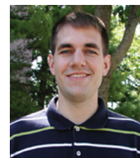
Jet Propulsion Laboratory, California Institute of Technology