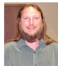
Redwood Cottonwood Rivers Control Area