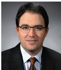
Iowa State University