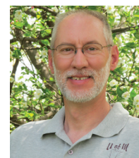
University of Minnesota