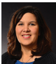
South Dakota State University Extension