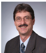
Iowa State University