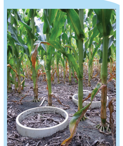
GHG measurement locations