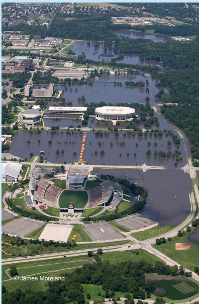
2010 flooding event in Ames, Iowa

Values before 1958 are taken from Antarctic ice cores. Values 1958-present are from Mauna Loa observatory.