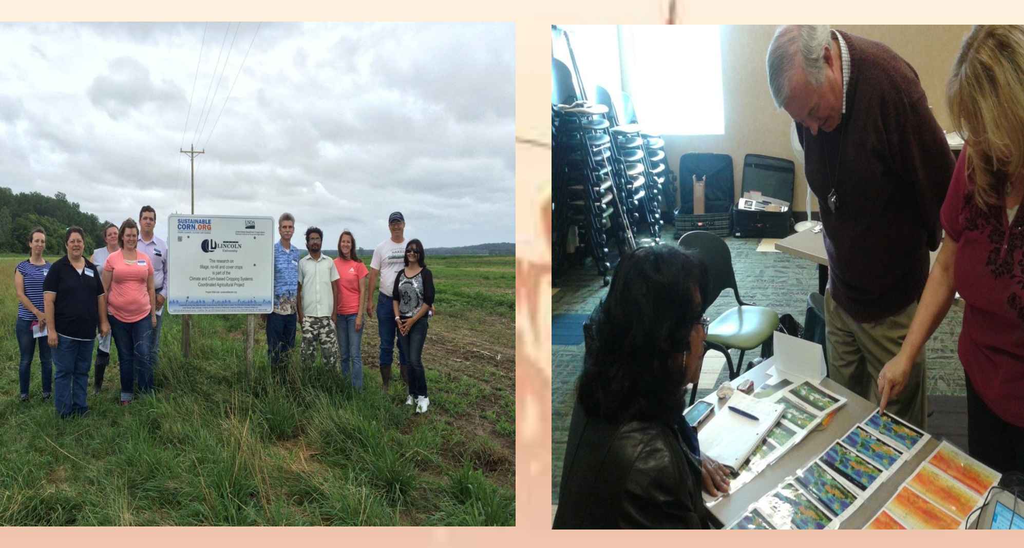
Group of teachers touring FORCK Farms.

http://www.camelclimatechange.org/resources/view/2 25634/?topic=66135 for examples.