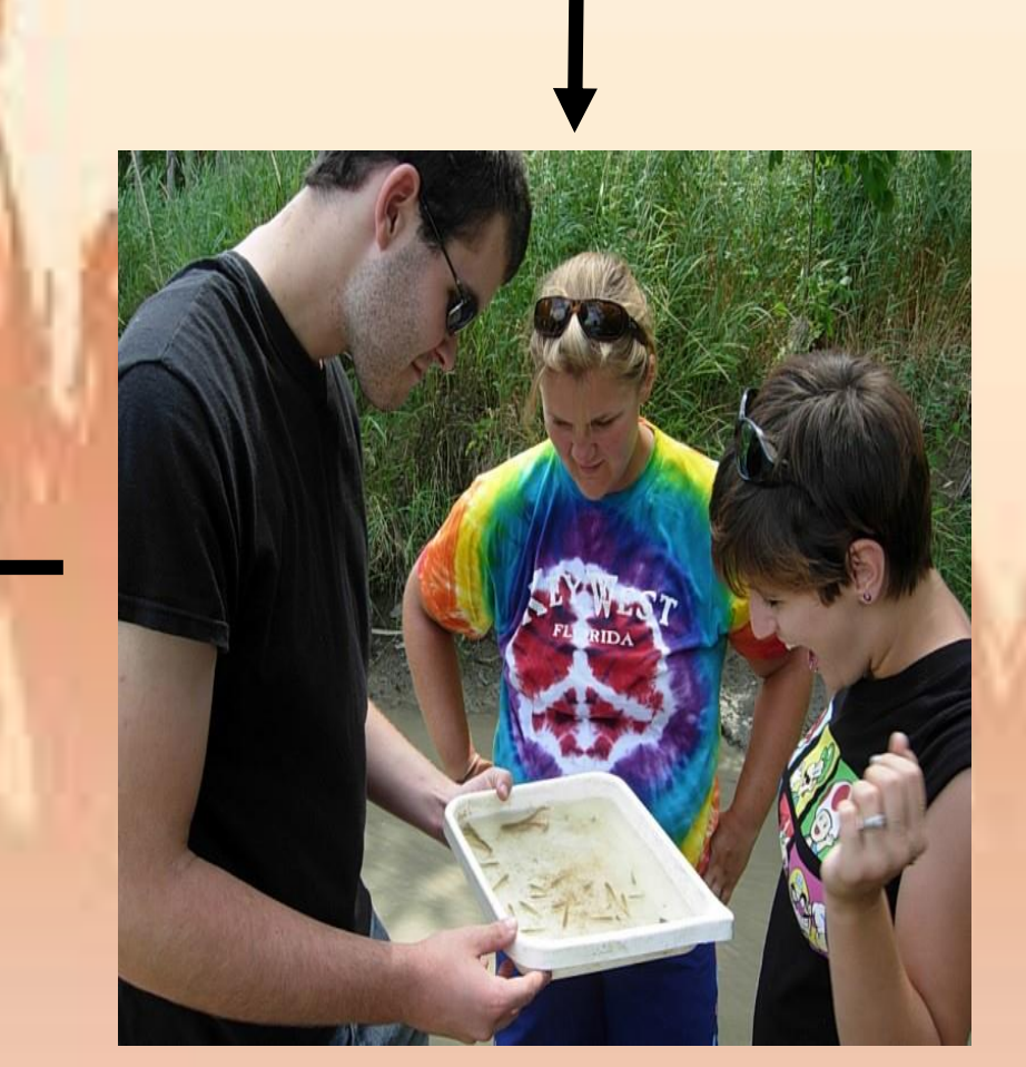
Invertebrate identification for HHEI measurements.