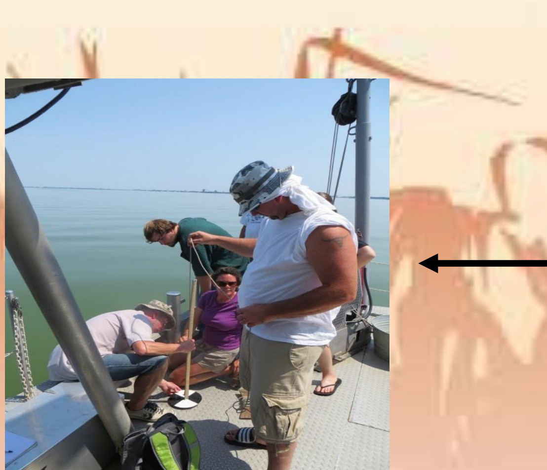
Measuring the Lake Erie alga bloom using a settchi.