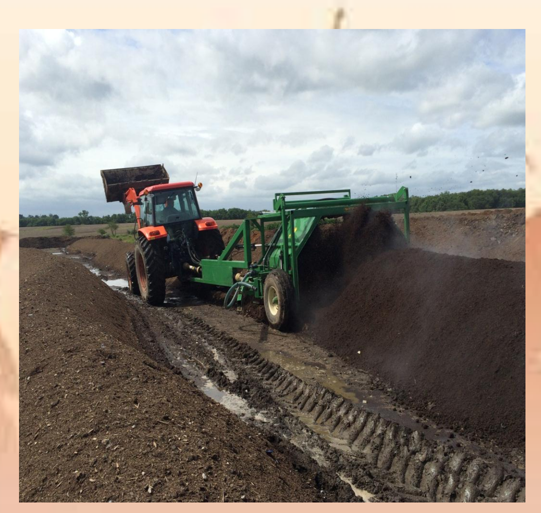
Touring a large scale composting plant Bluebird Composting.